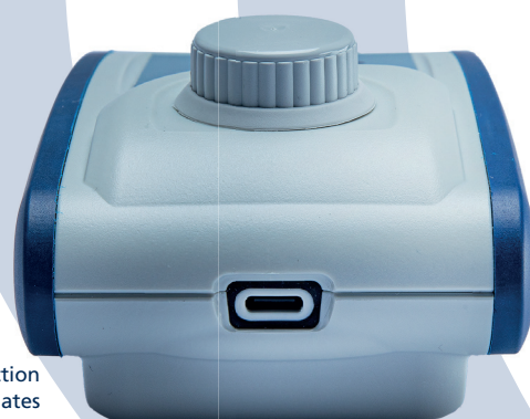
Waterproof USB-C connection for data export and updates

Store up to 100 sets of data, ensuring that all records meet GLP standards for integrity and reliability. Keep your data organized with easy transfer options via NFC using the Lovibond® AquaLX® App or choose a wired data transfer through USB-C using the Lovibond® Data Expert Software. Programming options for one user-defined method and easy instrument updateability empower you to customize your testing protocols effortlessly